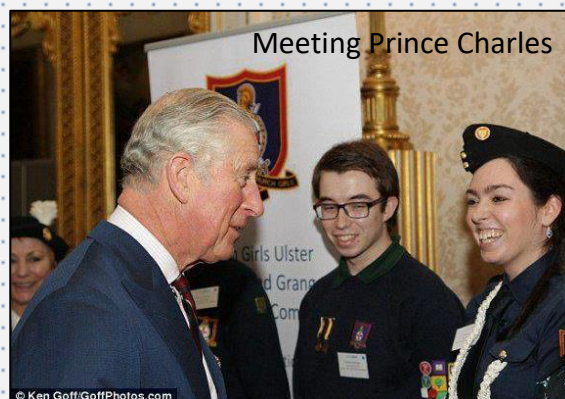
Meeting Prince Charles