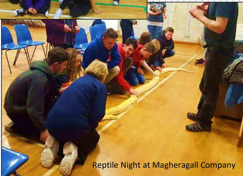
Reptile Night at Magheragall Company