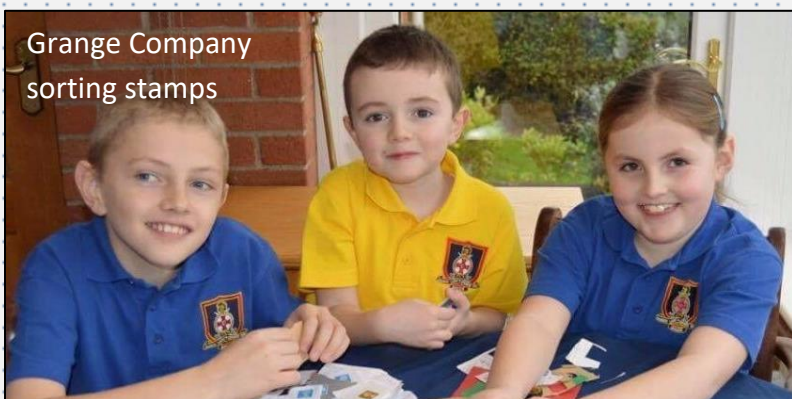
Grange Company sorting stamps