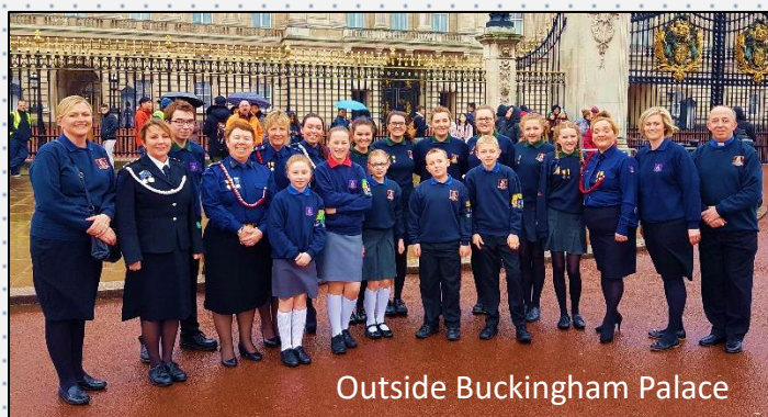
Outside Buckingham Palace