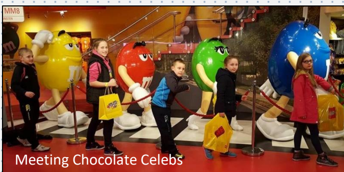
Meeting Chocolate Celebs