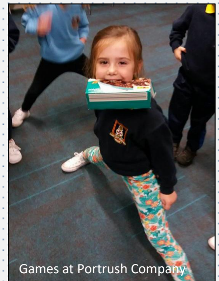
Games at Portrush Company