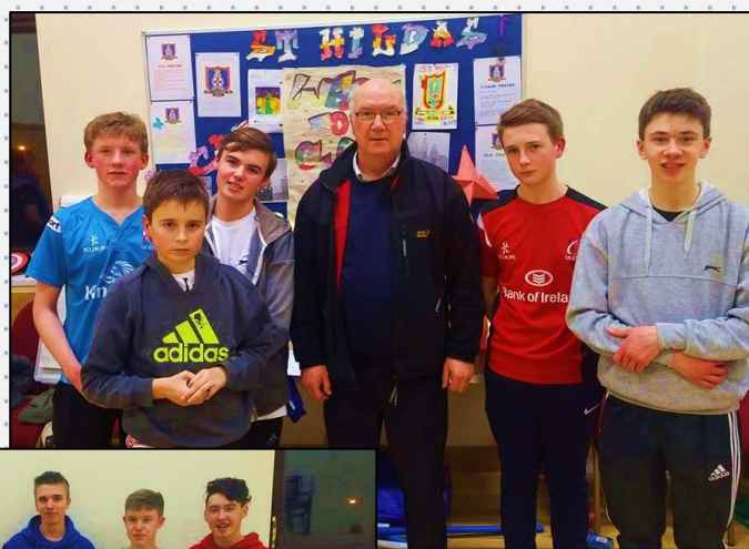
1 st /3 rd Battalion Unihoc