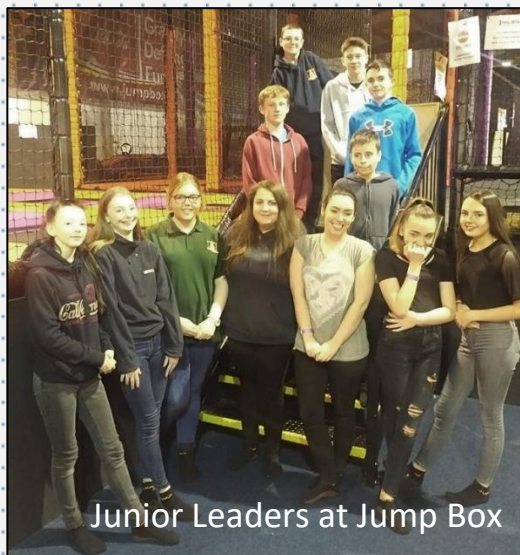
Junior Leaders at Jump Box