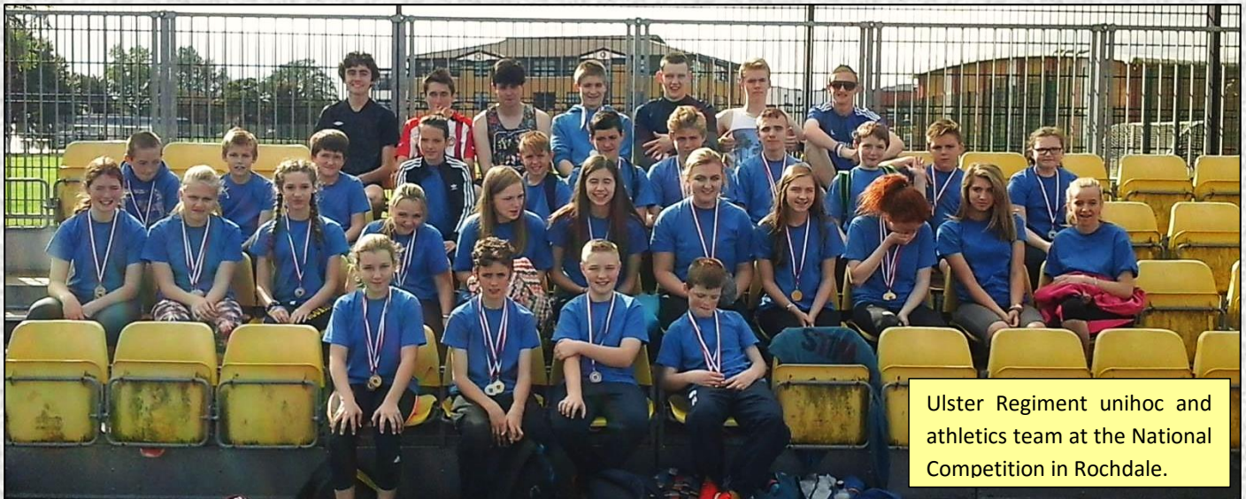
Ulster Regiment unihoc and athletics team at the National Competition in Rochdale.