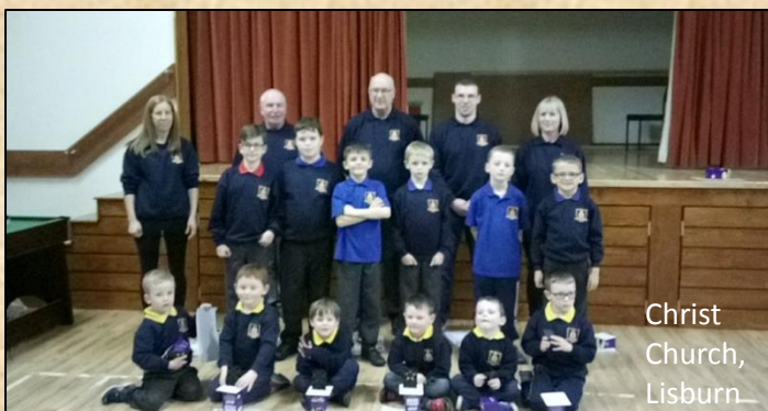
Christ Church, Lisburn