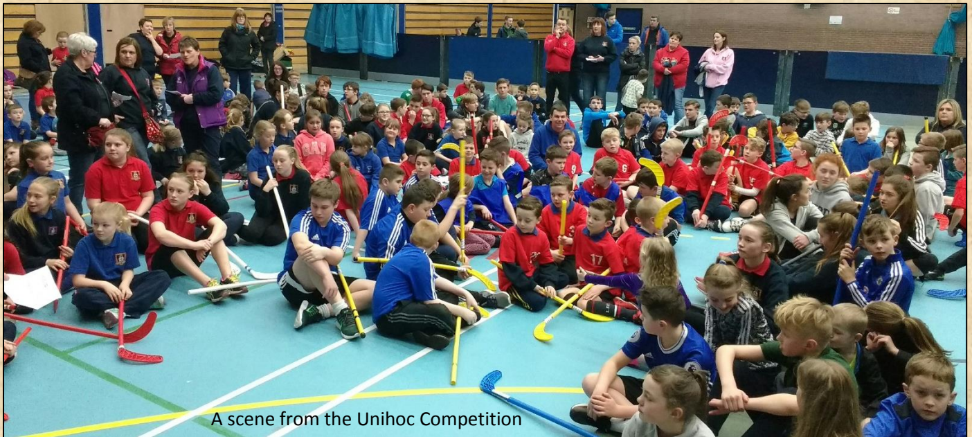
A scene from the Unihoc Competition